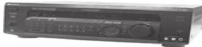
Photo : STR-DE935

US Model STR-DE835/DE935/SE591 Canadian Model STR-DE835/DE935 E Model Australian Model PX Model STR-DE835 Chinese Model STR-V828