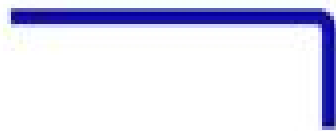
Right Angle Flange (also referred to as male Pittsburgh)