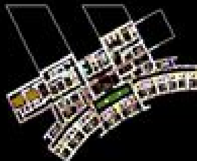
PLAN R+2 ECH 1/100