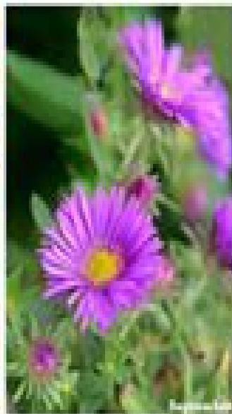
New England Aster Aster novae-angliae ☼☼ August-October (3 ft.)