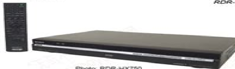
Photo: RDR-HX750 RMT-D247P