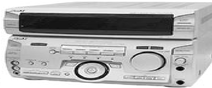
STR-W770 is RECEIVER section in MHC-W770AV.