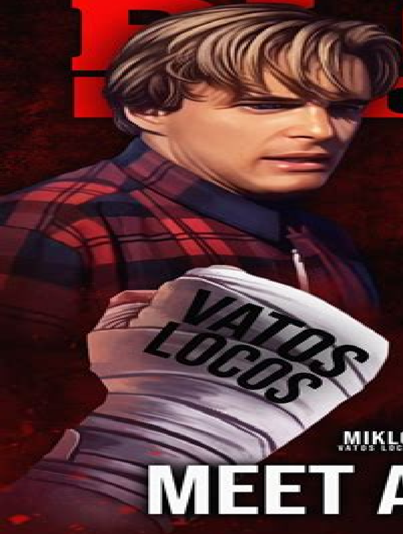
MIKLO VATOS LOCOS