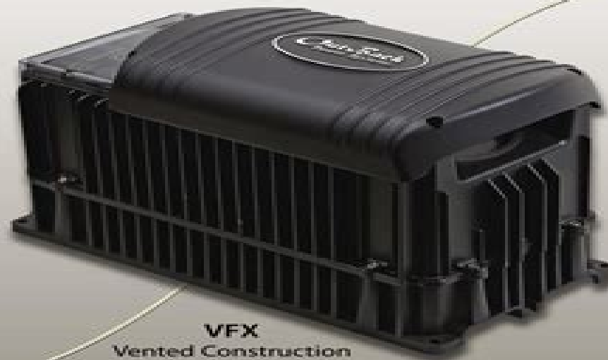
VFX Vented Construction