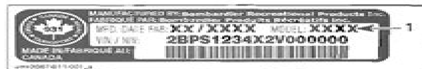
1. Model number

The Vehicle Model Number is scribed on vehicle description decal.