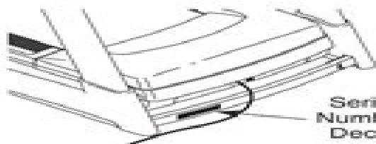
Serial Number Decal

Write the serial number in the space above for reference.