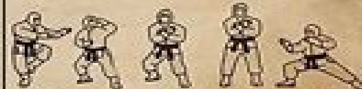
HICHO KOSEI JUMONJI HENKA JUMONJI KIKOU IKEN HAGI