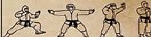
IKEN HIDARI HIRA ICHI MONJI HOKO KONGO GASSHO