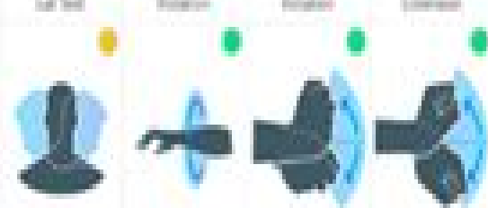
Lower Rotation Forearm Rotation Head Angle Head Forward Extension