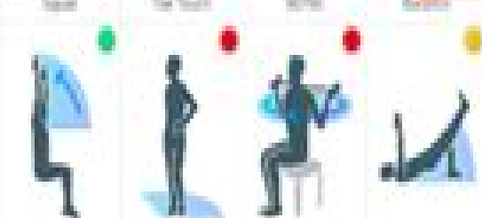
Left Foot Lower Quarter Rotation Twisted Trunk Rotation Bridge with Leg Extension