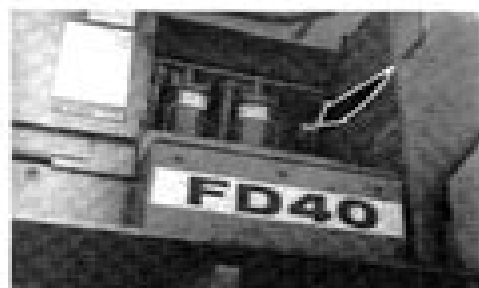
FIG.3 MASTER SWITCH LOCATION