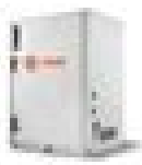
Mini Split System 1.5 to 2.0 tons