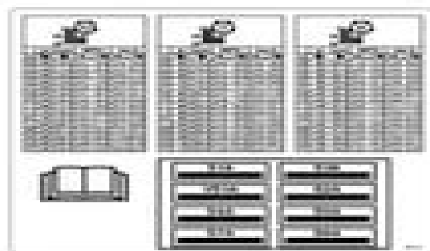
UNDER SEAT PLATE (Part No. 98-8710) Selecting Clip Rate & Schematic Wire Identification