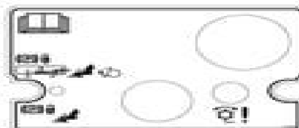
ON TOP OF STEERING TOWER (Part No. 83-1283) Brake Operation & road Control Lamp