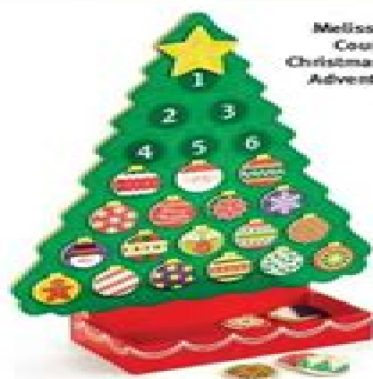
Melissa & Doug Countdown to Christmas Wooden Advent Calendar