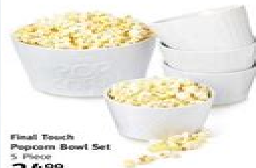
Final Touch Popcorn Bowl Set 5 Piece