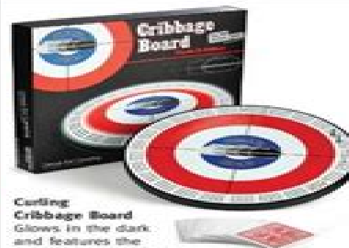
Curling Cribbage Board Glow in the dark and features the rings of a curling rink.