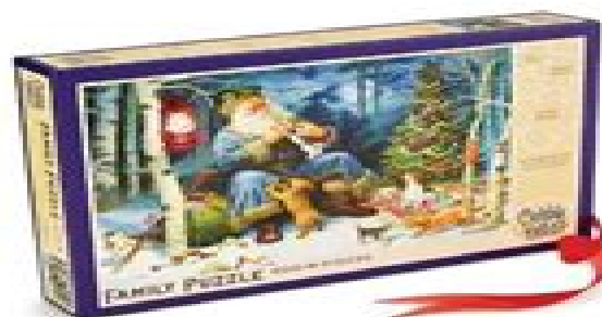
Cobble Hill Family Puzzle 400 Pieces