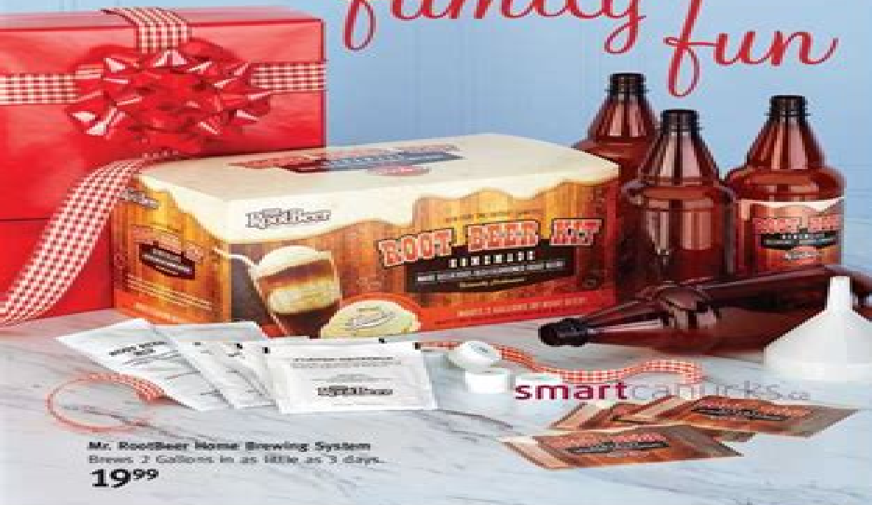
Mr. RootBeer Home Brewing System Brews 2 Gallons in as little as 3 days.