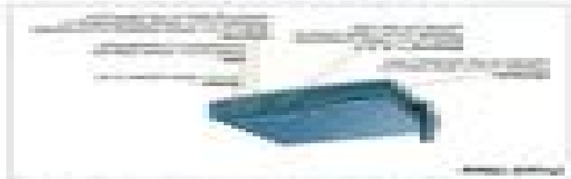
Figure 1: System Architecture