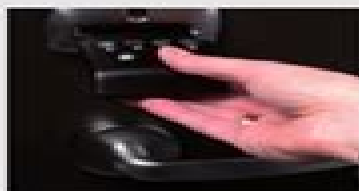
Upload/download lock information