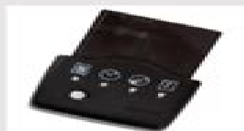
MiniLink to be purchased separately