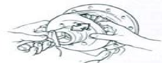
Fig. 10—Use a depth micrometer to measure distance from edge of case to end of side gear to determine thickness of thrust washer required to provide proper end clearance. Refer to text.

Install differential support housing into axle housing and tighten mounting cap screws to 83 ft.-lbs. (113 N·m) torque. Reinstall axle shafts and final drive units. Reinstall axle assembly under tractor. Refill axle housing and final drive housings to correct levels with Allis-Chalmers Power Fluid 821 or equivalent.