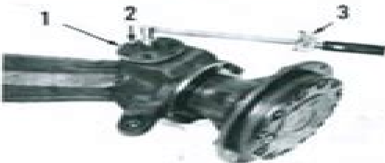
Fig. 8—Install special plate ACTP-3080 (1) on upper king pin, then use a torque wrench (3) to measure torque required to turn planetary unit. Install shims on lower king pin only to adjust king pin bearing preload.

Refill final drive housing and axle housing to correct levels with Allis-Chalmers Power Fluid 821 or equivalent.