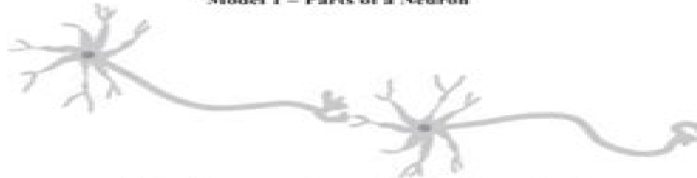
Model 1 – Parts of a Neuron

Cells are specialized for different functions in multicellular organisms. In animals, one unique kind of cell helps organisms survive by collecting information and sending messages throughout the body. The shapes and features of neurons, which are the primary cells in the nervous system, enable animals to experience all of the five senses; find food, mates, and shelter; and to survive in their diverse environments.