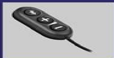
Illuminated 3-key remote control