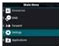
Main Menu Screen