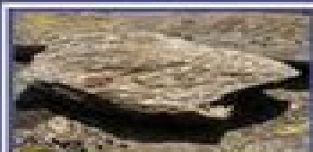
The Mica Group

is a variety of Zoisite. It is valued as a gem stone and has the chemical formula \text{Ca}_2\text{Al}_2\text{Si}_2\text{O}_{10}(\text{OH}) .