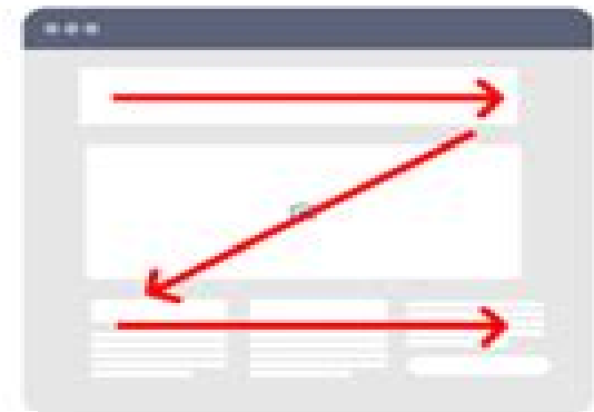
Z - Shape