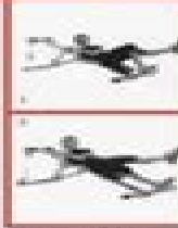
ONE LEG BOAT