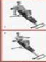
FRONT DOLLOPS BENCH