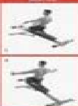
BACK DOLLOPS BENCH