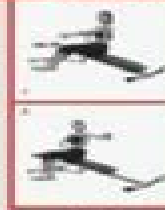
CROSSOVER PULL FEET DOWN