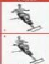
SCALED BRACE PRESS