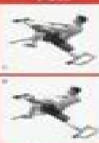
SCALED HILL PULL