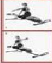
CROSSOVER PULL FEET UP