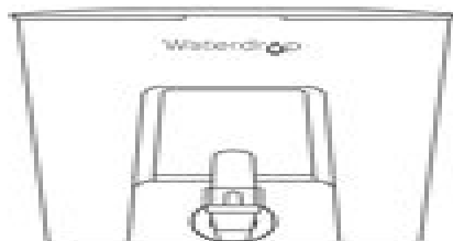
Dispenser filtration system Owner's manual